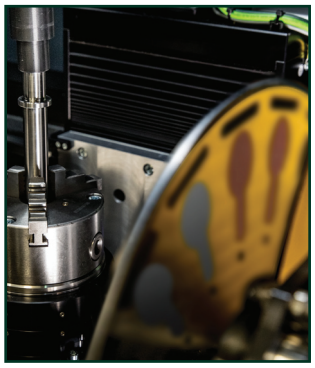
24/7 operation with integrated sample and filter changer