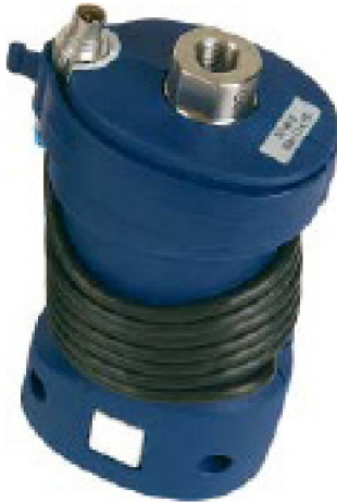
External IDOS universal pressure module

*Provides absolute pressure option in addition to gauge pressure. In absolute mode adds barometric pressure to gauge pressure range. For absolute mode ranges below 1 bar please consult your sales representative.