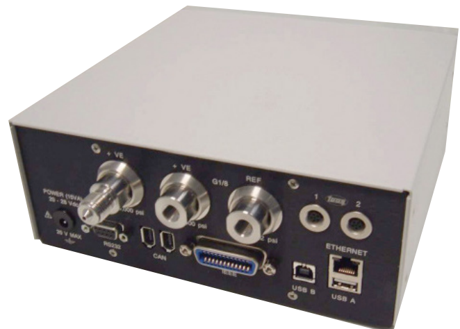
PACE1000 from the rear